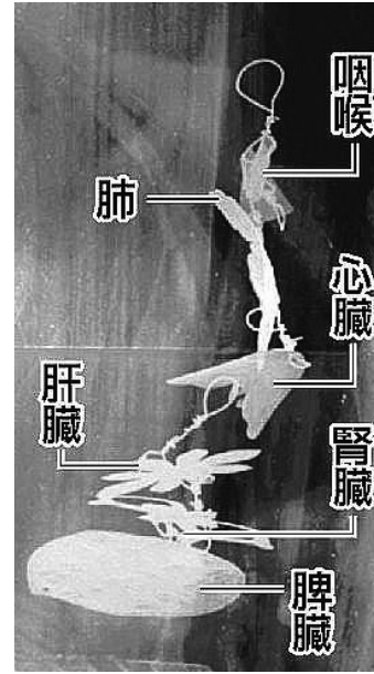
X-ray detail with explanation 23

monk Chōnen (齋然938-1016), who in 985 went on a pilgrimage to China, where he commissioned a copy of the legendary but now lost Udayana Buddha. 19 In the case of this 10 th century piece, the organs had been made from silk.