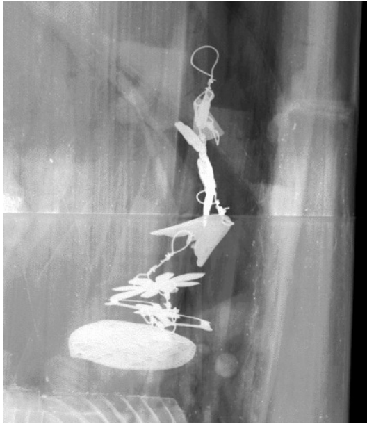
X-ray detail 22