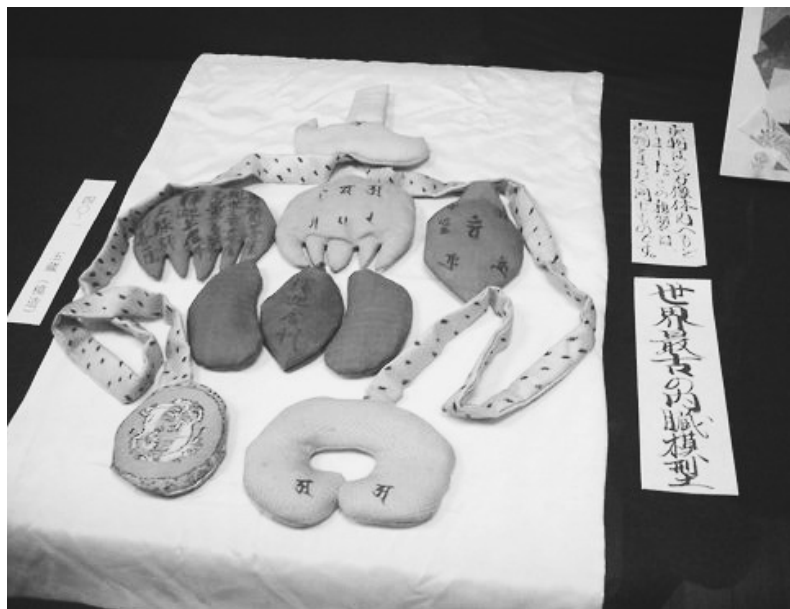
Replica of the silken organs found in the Shakyamuni Buddha in Seiryōji 45

form), and the five animating forces 五神, which were themselves understood to be formed out of qi and jing .” 43 Chinese medicine interprets aging and subsequently death as a gradual evaporation and depletion of these vital animating forces, so in China, the esoteric practice of outfitting a Buddha statue with dedicatory organ replicas, came to be seen as a way to spiritually (re)animate it and became popular in Northern Song Buddhist statuary, of which the above mentioned 10 th century wooden statue of Shakyamuni Buddha, found in Kyoto’s Seiryōji Temple is one example. 44