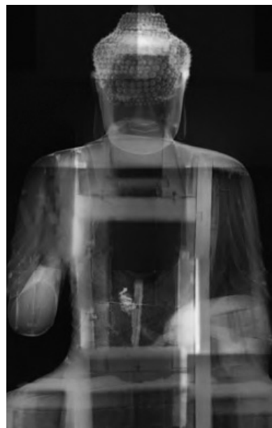
X-ray of Shōfukuji's seated Buddha 14