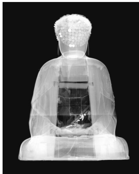
X-ray of Kōfukuji’s seated Shakyamuni 21