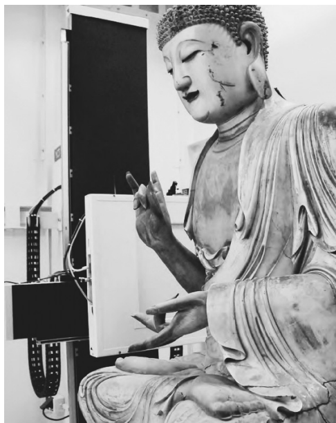
Shōfukuji's seated Shaka Nyōrai 13

In 2001, examinations of Shōfukuji's seated Shaka Nyōrai 11 statue, 12 a 17 th century Chinese wooden artwork of 148.5 cm in height, had already shown the insertion of the 5 Viscera. It was ascertained that these were