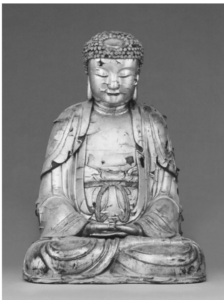
Kōfukuji’s seated Shakyamuni 20

It revealed a 15.5 cm long string with a Throat 18 (咽喉), and five thin silver elements, representing the Five Viscera (五臟六腑) or zàng-organs (臟): Heart (心臟), Lung (肺), Kidneys (腎臟), Liver (肝臟) and Spleen (脾臟). It was also found to contain a wooden staff as the representation of the spinal cord (脊髓), and yet unclear objects in the area above the statue’s hands, thought to be the fū organs (腑): Large intestine (大腸), Gall bladder (胆), Urinary bladder (膀胱), Stomach (胃), Small intestine (小腸) and Triple Energizer ( San Jiao , 三焦). A huge surprise was the detection of a bronze-mirror (10.3 cm in diameter and 1.1 cm thick) thought to represent the Spirit (魂). The only other Buddha statue known to contain a mirror, can be found inside the Shaka Nyōrai at Seiryō-ji (清凉寺) in Kyoto. The Kyoto statue is said to have been brought to Japan by the